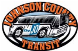
Johnson County Transit