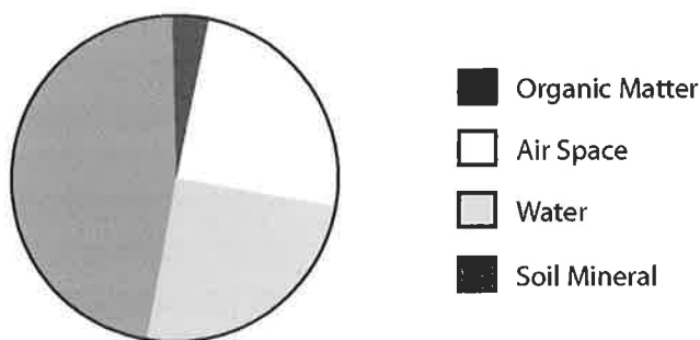
Figure 2. Soil components in typical proportions

Onsite alternatives may be suitable for sites with profiles that do not have the desired depth and permeability conditions. Enhanced treatment systems provide a higher quality effluent than produced by septic tanks. This allows marginal soils to more easily absorb wastewater. However, these alternative systems require more attention to design requirements, material selection, and construction detail. Regular maintenance is critical to good performance and long life of these systems.